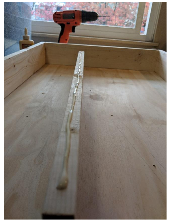
Figure 4: Gluing the wood before screwing makes the machine much more sturdy and helps seal wood seams.

Once the frame is glued and screwed in, the weather stripping can be added. It can be stuck on the top end of the lumber. The weather stripping will make sure there is a good seal when the plexiglass door is closed and the machine is in operation.