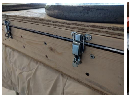
Figure 8: Close up of the clasps

Once the hinges and clasps are attached the weight can be removed. Now comes the real test – can you open the door?! The weather stripping will hold onto the plexiglass tightly and it will be hard to open - so open it slowly and carefully.