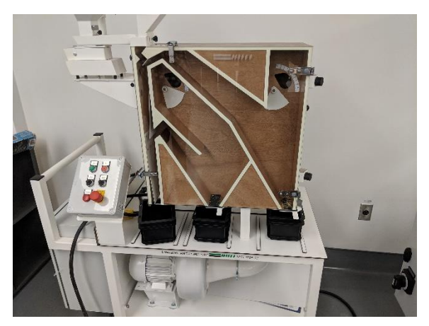
Figure 1: Pictured here is a commercial version of the zigzag air separator

The zig-zag seed cleaner works, in short, by creating a column of air which sucks the lighter seed into a separate chamber from the heavier, better-quality seed. A portion of the air column narrows, which increases the air pressure, drawing the lighter seeds and chaff through. Once the seed has passed through the narrow gap there is a drop in pressure as the gap widens - causing the seeds to drop down and now get sucked up through the air-suction mechanism (also known as a vacuum!). Pictured here is a commercial version of this type of seed cleaner. The zig-zag portion of the cleaner refers to the back and forth motion the seeds are subject to when they are dropped down the seed chute which keeps them suspended longer for easier suction of lighter materials.