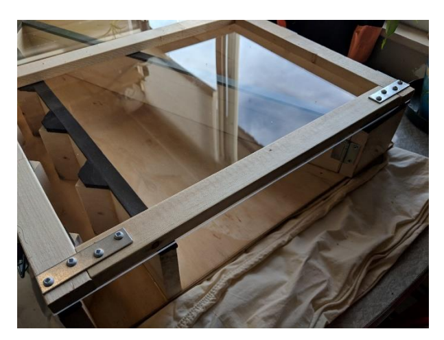
Figure 5: Brackets help strengthen the plexiglass door