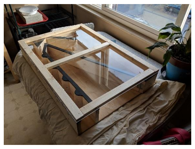
Figure 6: Place the door on the machine to ensure it fits!