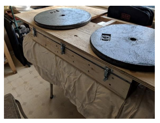
Figure 7: Here you can see the weights still on the machine after the clasps have been affixed.

The door will be affixed to the machine in two ways: with brackets and chest clasps. We want the door to fit very tightly so it is well sealed when the machine is in operation. To do this, we positioned the door on the machine then placed heavy weight on top, which essentially compresses the weather stripping under the door. While the weights are on the door, start by attaching the hinges on one side. Once the hinges are attached, attach three clasps on the opposite side and one at the top. This will ensure the door is well sealed and held tight when in operation.