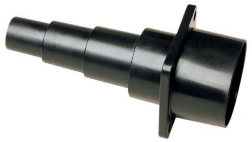
Figure 5: Vacuum hose adapter from Ridgid

The vacuum hole can be cut to fit the vacuum you are using or can remain small and fitted with an adapter for larger diameter hoses.