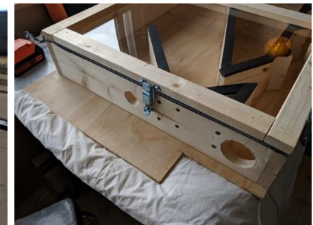
Figure 9: The machine has a single clasp on top, positioned in the centre.