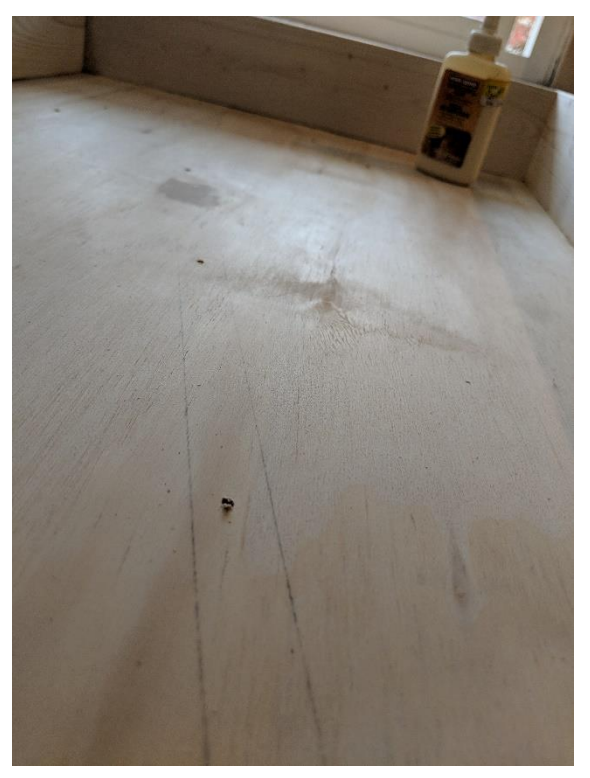
Figure 3: Tracing where each of the pieces sit on the plywood helps to drill the pilot holes.